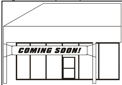
Bungee Cord Method (Preferred)